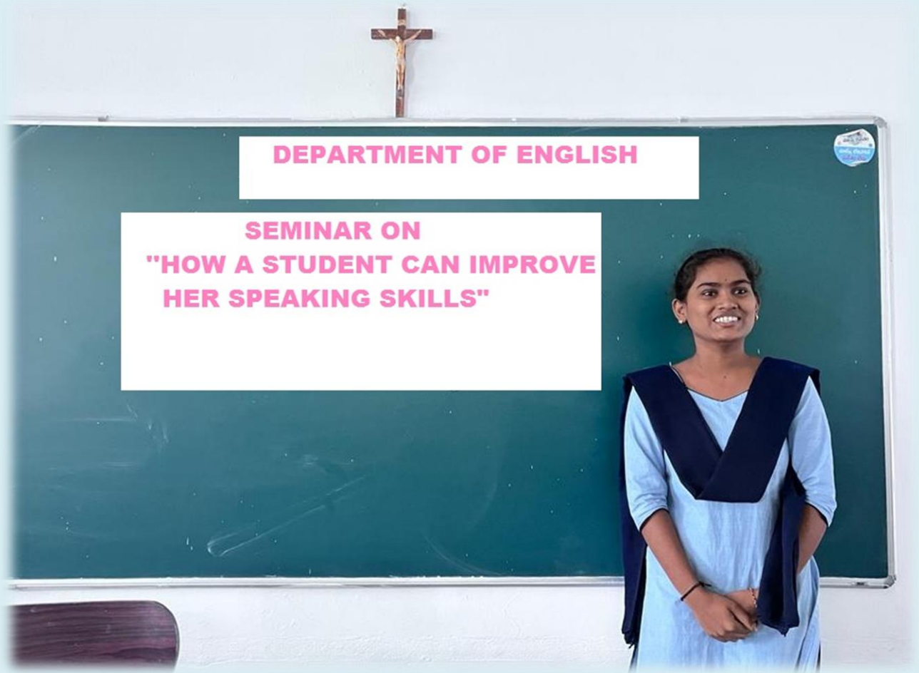
A STUDENT' SEMINAR PRESENTATION