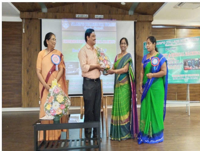
Honoring The Guest With Bouquet