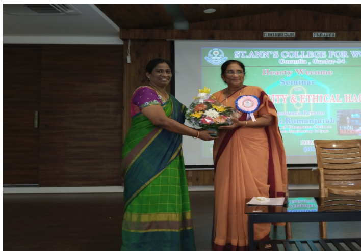
Honoring The Sister With Bouquet