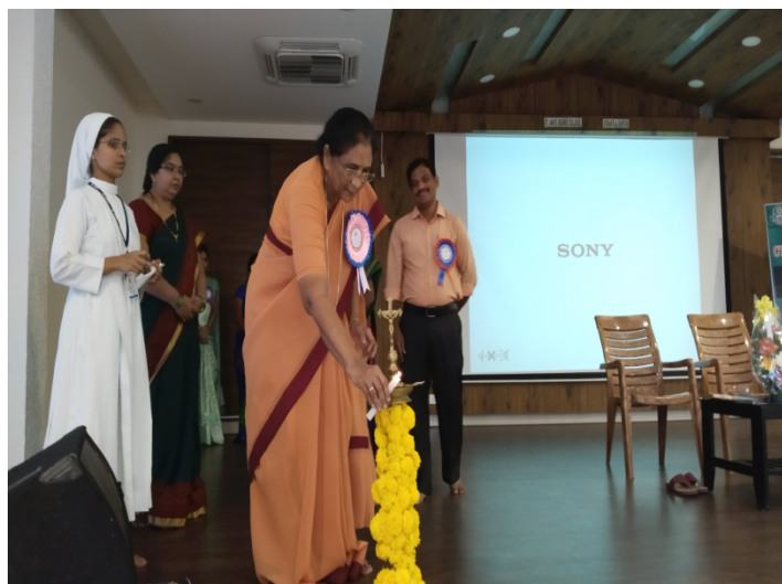
Lighting the Lamp by Principal Sister