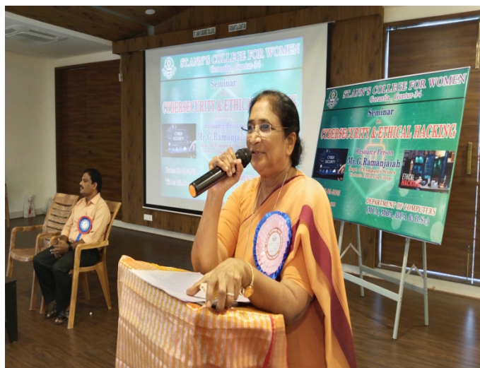
Opening Remarks by our Principal Sister