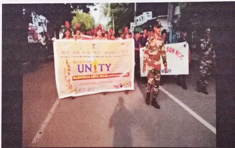
Students are Participated in Unity Day

In the remembrance of the sacrifice made by our freedom and on the occasion of Rastriya Ekta Divas, our Guntur Group has conducted rally for all the battalions of Guntur including 10(A) Girls Battalion, 25(A) Battalion, 22(A) Battalion, 23(A) Battalion, 2 Armed SQN and 1 Engineer Coy Battalion. The rally was started at Collector Office and ended at Municipal Office. Finally, the rally was dispersed after distributing snacks to the cadets.