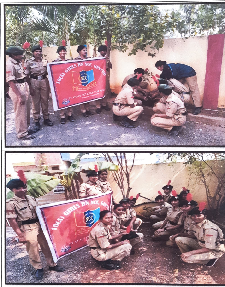
Students are Participated in Tree Plantation Programme