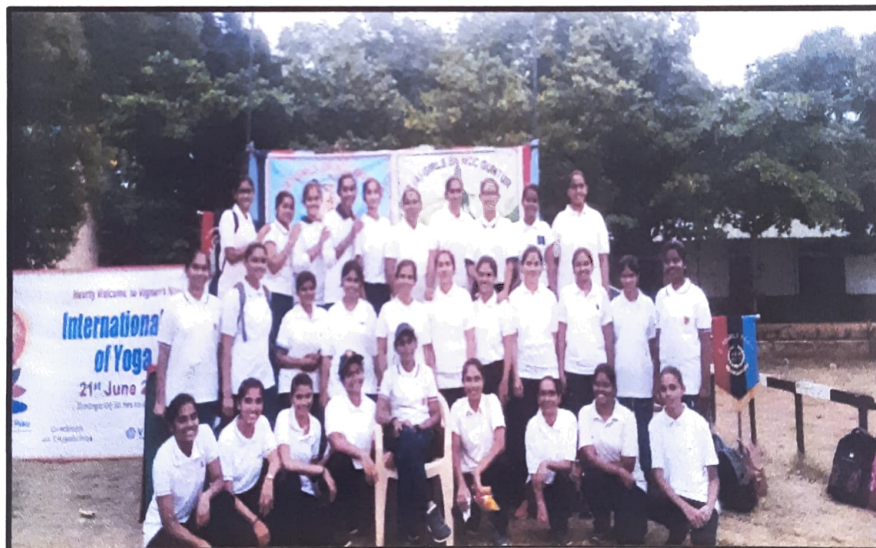
Students are Participated International Day of Yoga