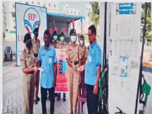
Our NCC cadets distributed masks to the people